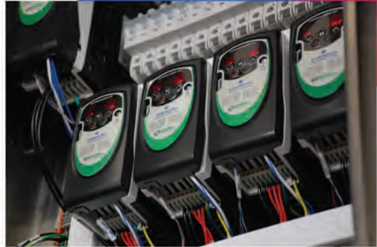
Variable frequency drives enable the Gen5 Brush Control System to maximize brush to vehicle precision, contouring and cleaning